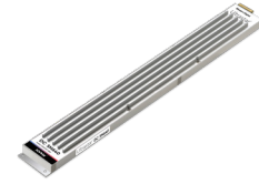
Enterprise and Data Center Small Form Factor (EDSFF)